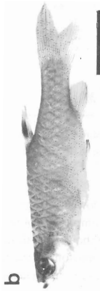
Figure 1 - Karyotype (a) and a specimen of Pyrrhulina cf. australis (b). Thin bar = 10 \mu m and thick bar = 1 cm.