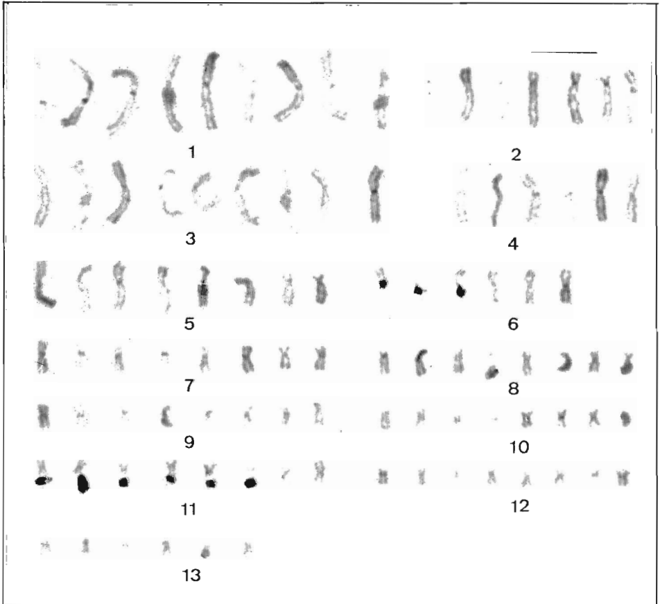
Figure 2 - Nine NORs in chromosomes of groups 6 and 11 of C. aurita ( C. dorsata 8n = 104 ). AgAs staining, Bar = 10 \mu\text{m} .

The cytophotometric data indicated variability in DNA content among the three specimens analyzed (Table I).